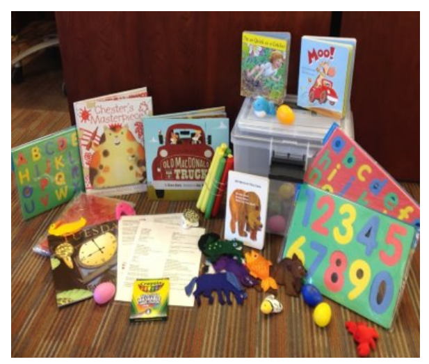
Literacy kits included a variety of books, manipulatives to increase motor skills, puzzles to develop number and letter recognition, shakers to connect with a music theme, and finger puppets to develop vocabulary, and a song list.

Each week the librarian from Ignacio Community Library District focused on one of the five early literacy practices and FFNs receive a plastic box to store all the materials. Librarians recognized their important role as early literacy teachers for FFNs as they modeled reading techniques during Story Times with young children and demonstrated activities that can enhance or build upon early literacy interactions. The information and tools provided to FFNs increased their level of comfort in using the resources at the library and at home in their role as teachers of the children in their care. "One mom took our GRT class (Five Best Practices of Early Literacy). At first, she was hesitant about the books and why we chose them. Now she's excited and tries reading at home. She's more confident with literacy and reading with kids." (Ignacio). As one librarian noted, "What could be better than sharing the love of reading?"