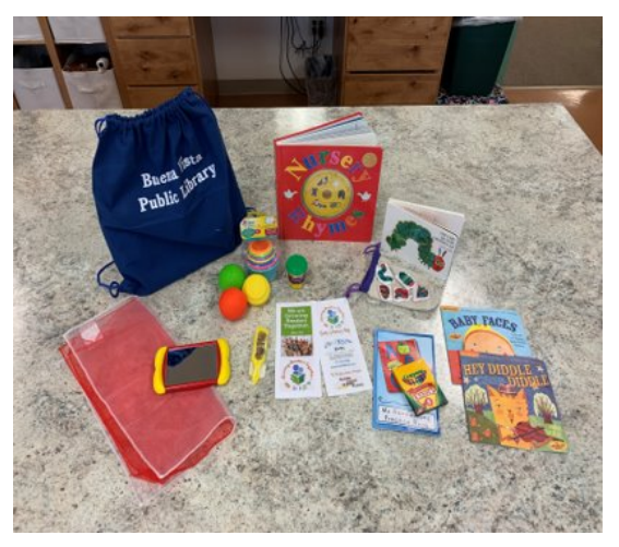
Literacy kits included a bag to store the materials, crayons, handwriting book, sorting cups of different colors and sizes, and a variety of books.

Librarians put a lot of thought into the preparation of early literacy bags or kits, and many assembled kits according to themes or adjusted for the child's age, either to be given away to FFNs or to be part of the permanent library collection. Librarians reported the flexibility of the grant was one of the parts they liked the most about GRT because it allowed them to decide whether to purchase, books, computers, or enhancing the environment based on the needs of their libraries. "We are the hot spot for little kids. We used the grant money to buy board books and leveled books. I ordered 2 shelves for the kids' room, the grant partly paid for them and our library covered the rest. It was great." (Northern Chaffee County- Buena Vista).