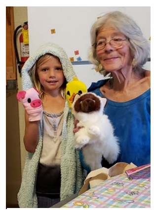
A child and her grandmother participating in a GRT event with hand puppets. (Park County)

Observations of FFNs Engagement. Libraries increased the number of caregivers coming to the library to check out books and other resources and attend Story Time. Enhancements to physical environments encouraged patrons to linger after Story Time to meet and talk with other caregivers or just to hang out. One site purchased an espresso machine to make the library an inviting place for people to visit and believed it influenced FFNs to stay to talk longer after Story Time. A librarian said, "The space we created has been great in engaging people, with the goal of getting them to linger at the library and stay after Story Time. We observed new connections being made, and FFNs talking to each other." (Westminster).